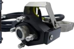
PROBE AND PROBE HANDLER